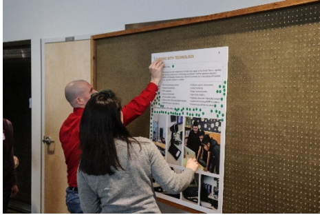
Table “Dot” Exercise Results

Bond Summit attendees were given the opportunity to lend support to the seven listed projects , as well as present new project ideas if they felt there’s something else bond dollars should go toward. Every attendee received eight “sticky dots” to place on the seven projects, which were spread out throughout the room on large poster boards. Attendees could distribute their dots however they felt was appropriate, sometimes placing multiple on one project and none on others. The activity’s purpose was to provide additional information for the district and School Board. The dot totals are listed below: